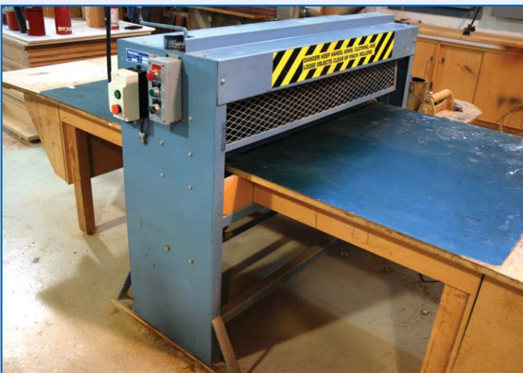
MARBEL ROLLER, MODEL PR 51