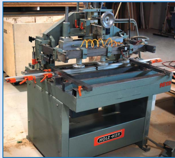
HOLZ HER MULTI DRILL, MODEL 1619