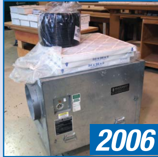
ABATEMENT TECHNOLOGIES HEPA-AIRE NEGATIVE AIR MACHINE