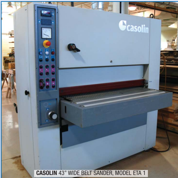
CASOLIN 43" WIDE BELT SANDER, MODEL ETA 1