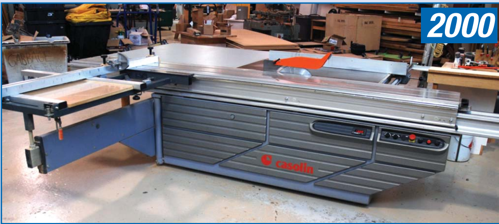
CASOLIN SLIDING TABLE SAW, MODEL ASTRA DG7 TA