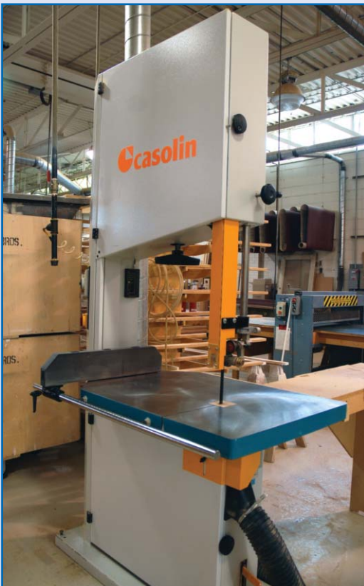
CASOLIN VERTICAL BANDSAW, MODEL BS 740