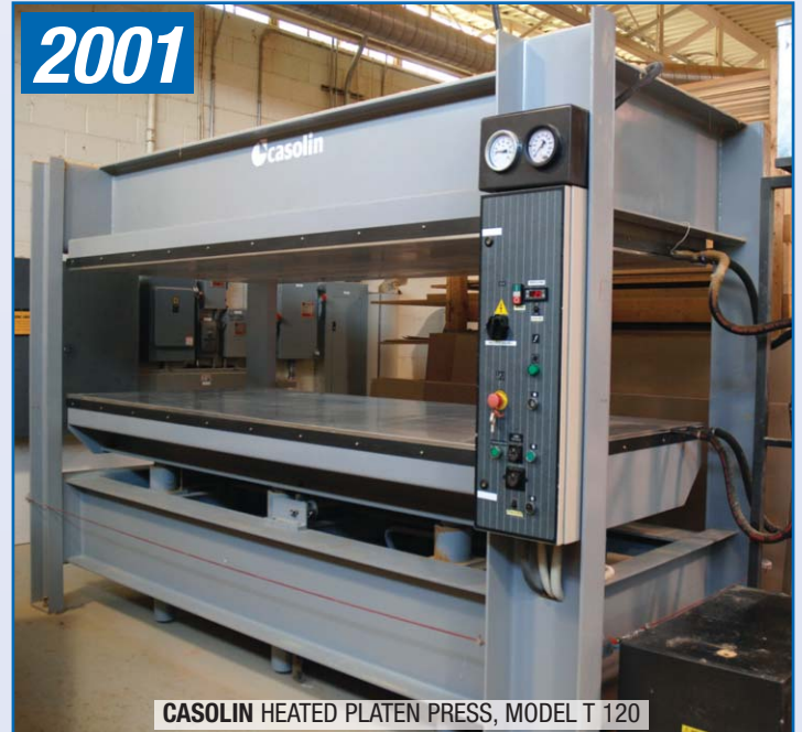
CASOLIN HEATED PLATEN PRESS, MODEL T 120