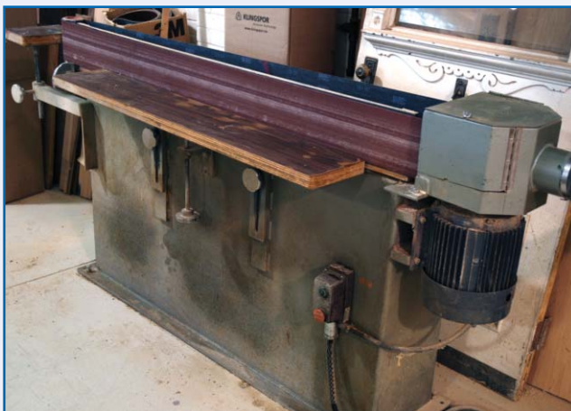
PROGRESS BELT SANDER, MODEL PLC 152