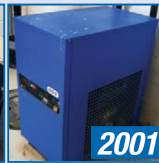
MOTIVAIR AIR DRYER