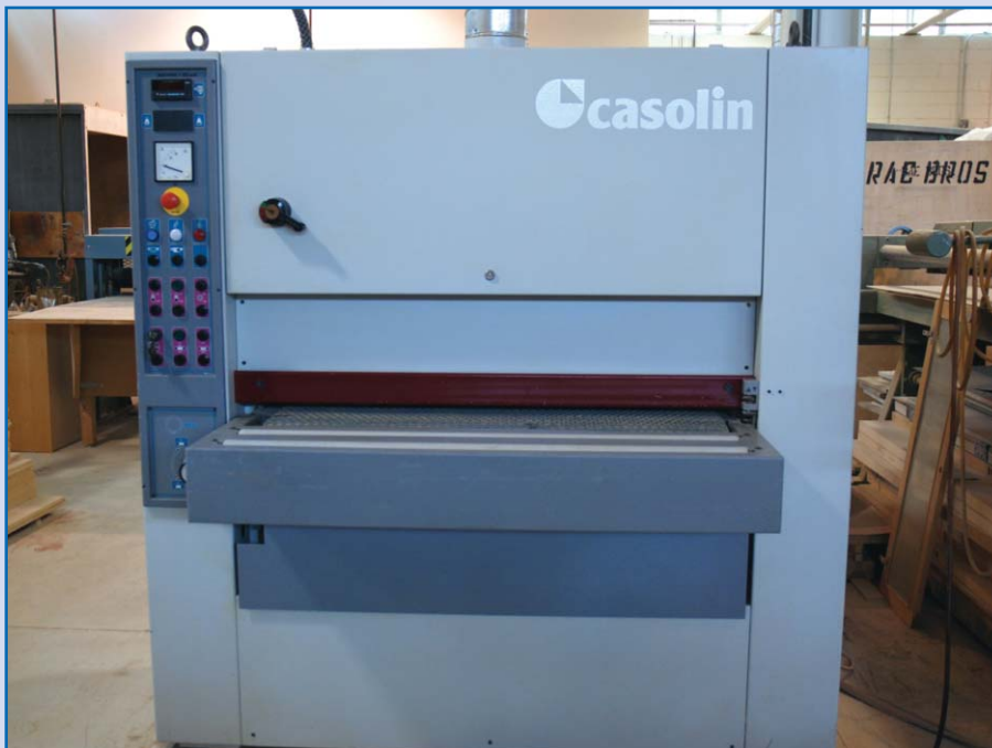
CASOLIN 43" WIDE BELT SANDER, MODEL ETA 1