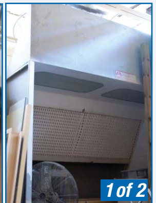
ATLANTIC INTERNATIONAL PAINT BOOTH