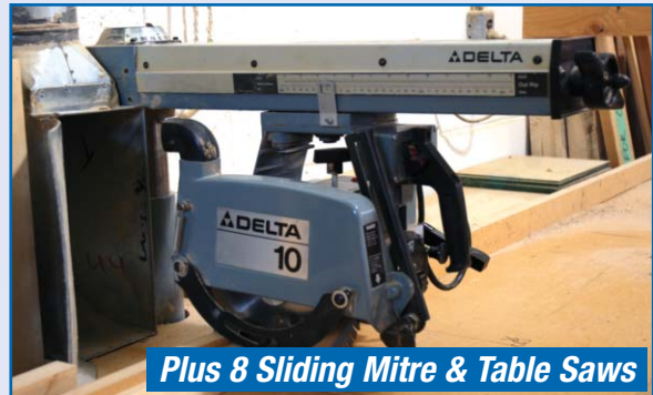
DELTA 2' RADIAL SAW