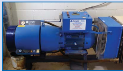
COMPAIR 25 HP AIR COMPRESSOR