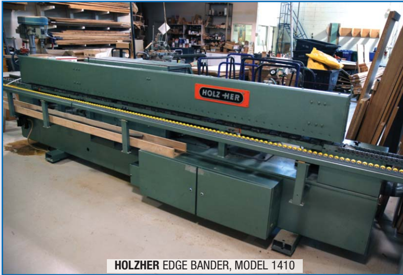
HOLZHER EDGE BANDER, MODEL 1410