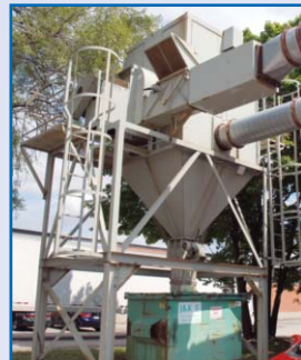
KRAEMER DUST COLLECTOR