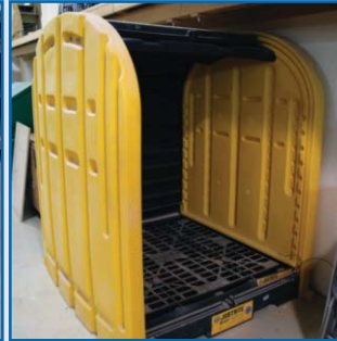
JUSTRITE ECO POLYBLEND DRUMSHED