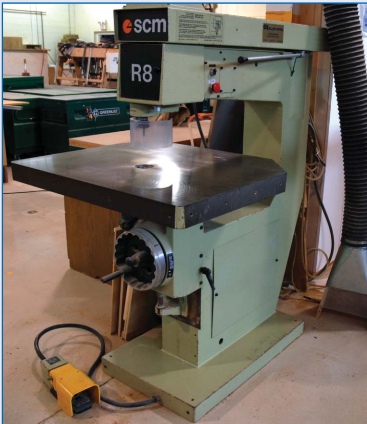
SCM ROUTER, MODEL R8