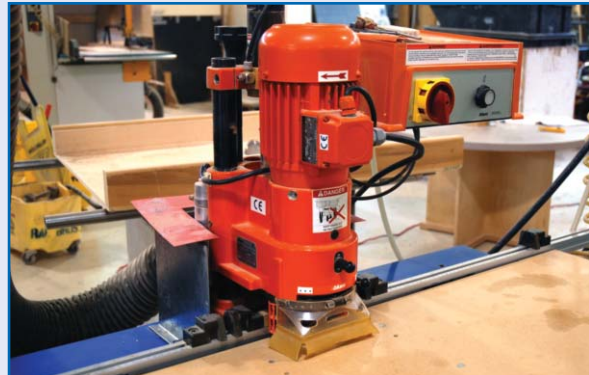
BLUM MINI DRILL