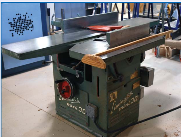
SCM SHAPER, MODEL MINI 30