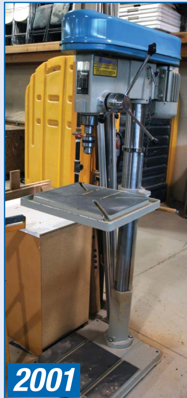
SILVER DRILL PRESS, MODEL CH-25