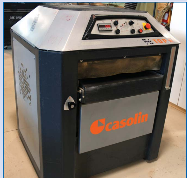
CASOLIN PLANER, MODEL TOP STAR 630