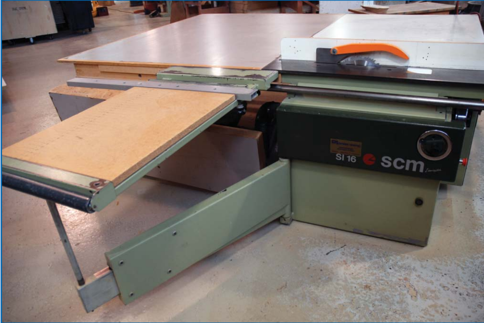
SCM SLIDING TABLE SAW, MODEL SI 16 SF