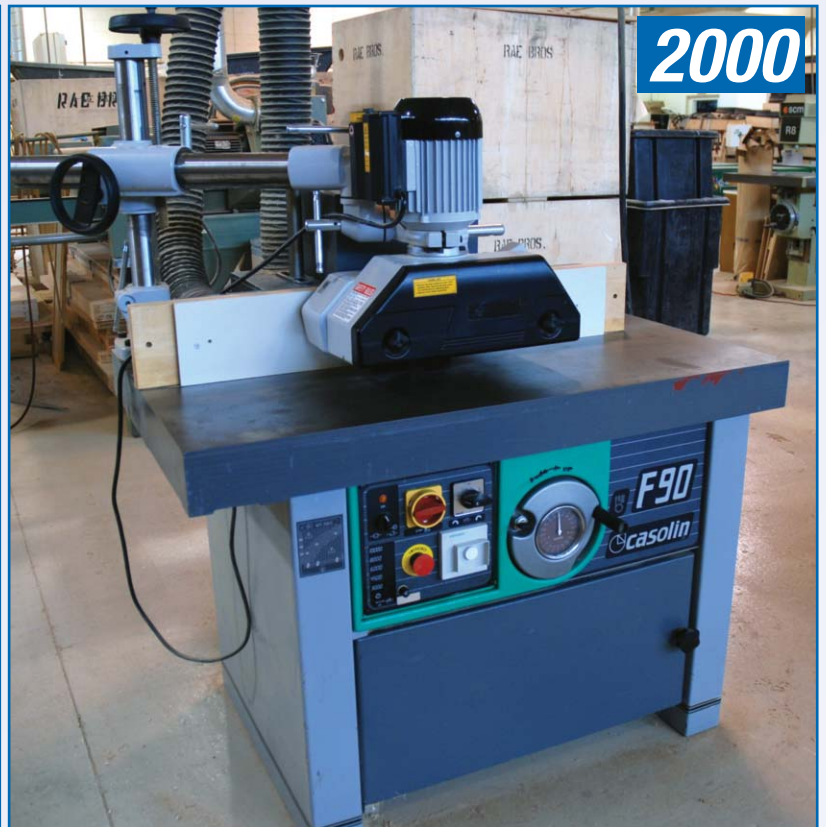
CASOLIN SHAPER, MODEL F90